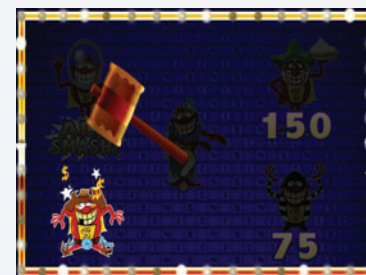
Smash a Whammy